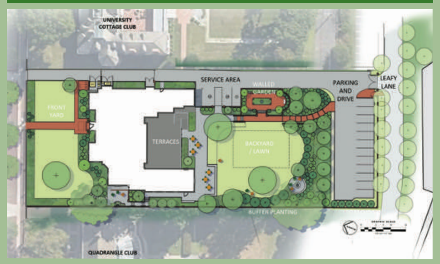
[above] Proposed site plan including new southern boundary

The impending sale of Ivy's southern parking lot will allow us to undertake a number of long-deferred landscape improvements to our magnificent property. Envisioned to complement the transformational alterations made to our clubhouse over the past decade, the landscape projects will expand outdoor social and recreational