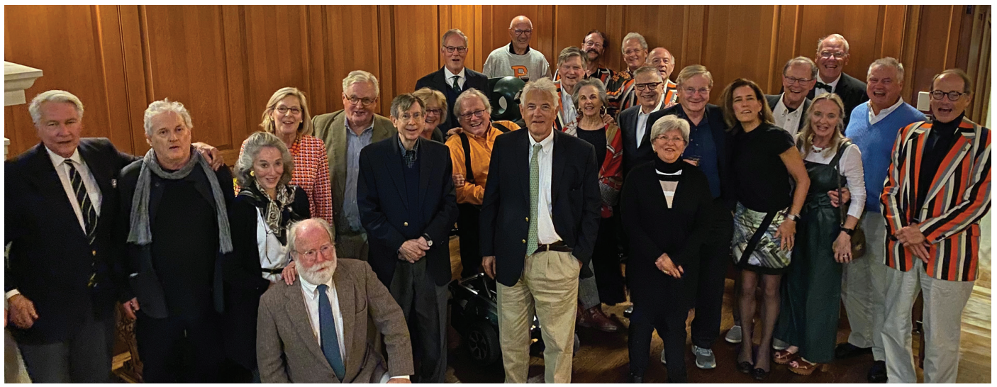
[above] 50th reunion for the section of '71 and friends