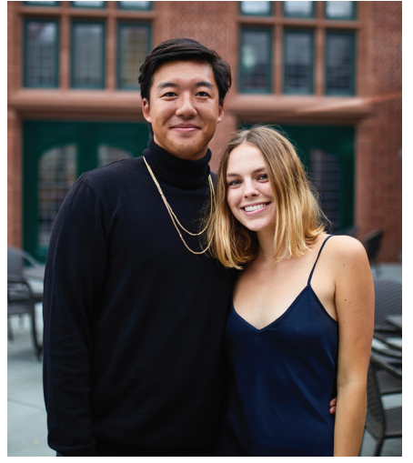
[above] Ivy Formals