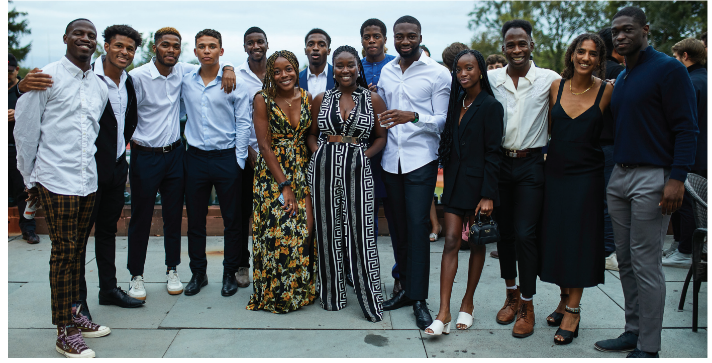
[above] Ivy Formals