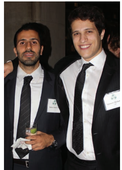
[above] The Alumni Dinner at the Racquet and Tennis Club in New York was well-attended and enjoyed by all