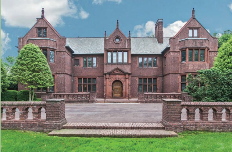
[above] Constitution Hill, another beautiful Princeton property designed by Ivy clubhouse architect Cope & Stewardson