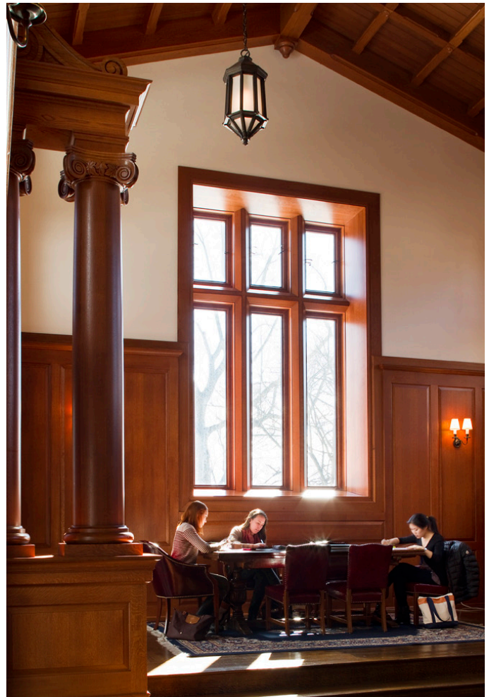
[above] Great Hall, Griffin Wing

As pictures within this newsletter demonstrate, the Griffin Wing surpassed our greatest hopes. Its classic yet distinctive architectural character, the seamless integration with our original 1800's building and the timeless craftsmanship dedicated