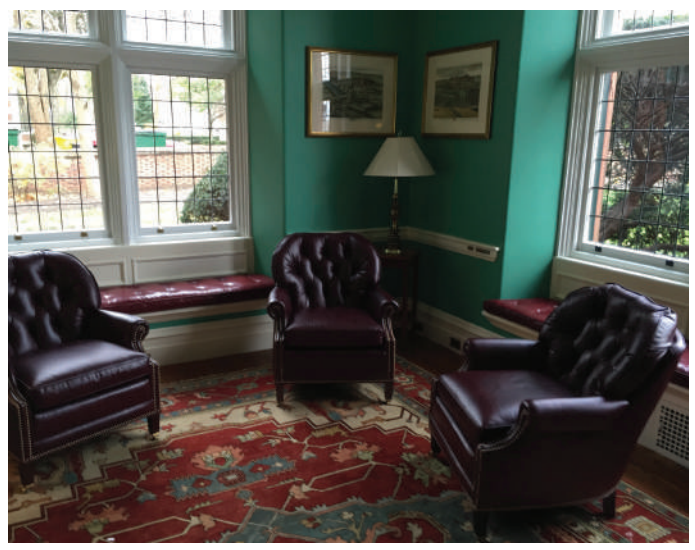
[above] The Green Room has received a handsome makeover and is now more functional for member use.

The following renovations to the Clubhouse were recently completed: