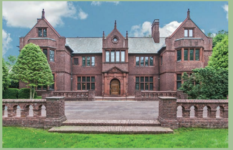
[above] Constitution Hill, another beautiful Princeton property designed by Ivy clubhouse architect Cope & Stewardson