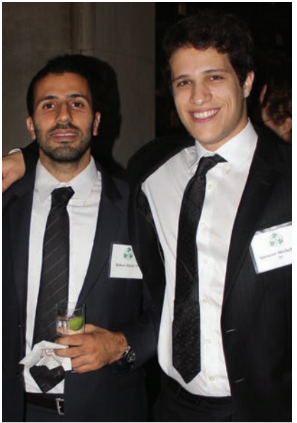
[above] The Alumni Dinner at the Racquet and Tennis Club in New York was well-attended and enjoyed by all